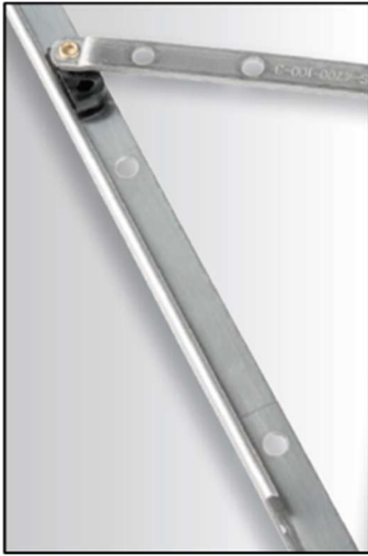
Recalled Hinge Track with hinge arm attached