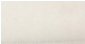
Satin Nickel PVD