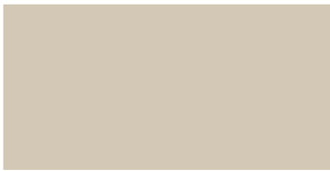
Foam TPE - Beige