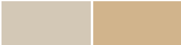
Foam TPE - Beige