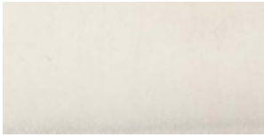
Satin Nickel PVD