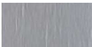
Brushed Chrome PVD