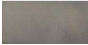
Oil Rubbed Bronze PVD