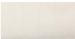
Satin Nickel PVD