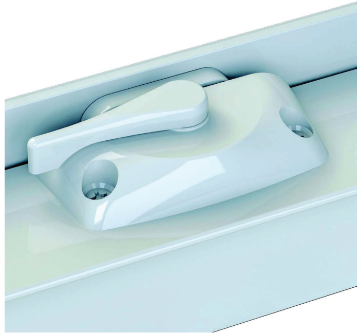
Hybrid Lock System

This lock series was designed to provide window manufacturers a high quality, low cost product while maintaining superior aesthetics.